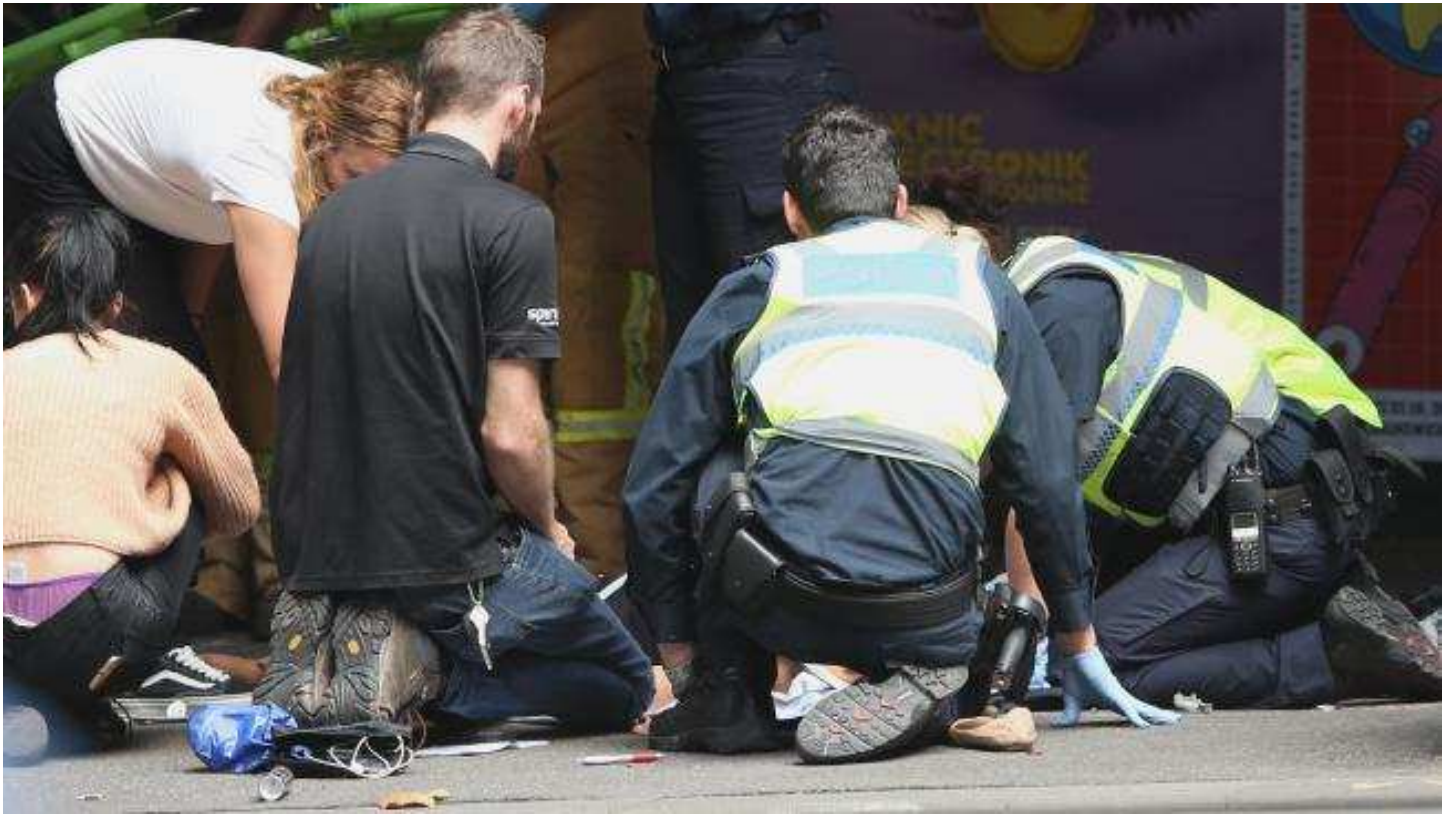
📷 Police and emergency services tend to an injured person in Bourke St.