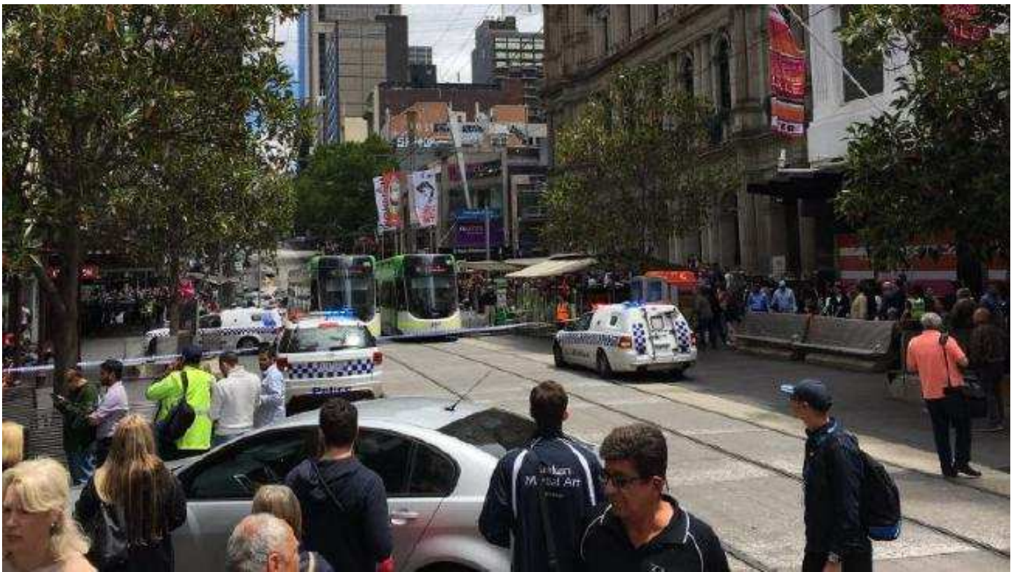
📷 Emergency services at Bourke St Mall.

Witnesses said the vehicle travelled north on Swanston St then west into Bourke St Mall.