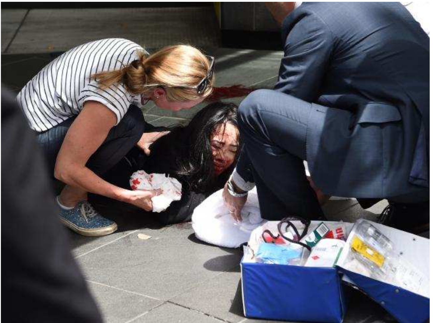
📷 Pedestrians rushed to help those mowed down in Bourke Street.

An infant, thrown from its pram, was so seriously injured police could not wait for an ambulance and instead it rushed it to Royal Children's Hospital in a police car.