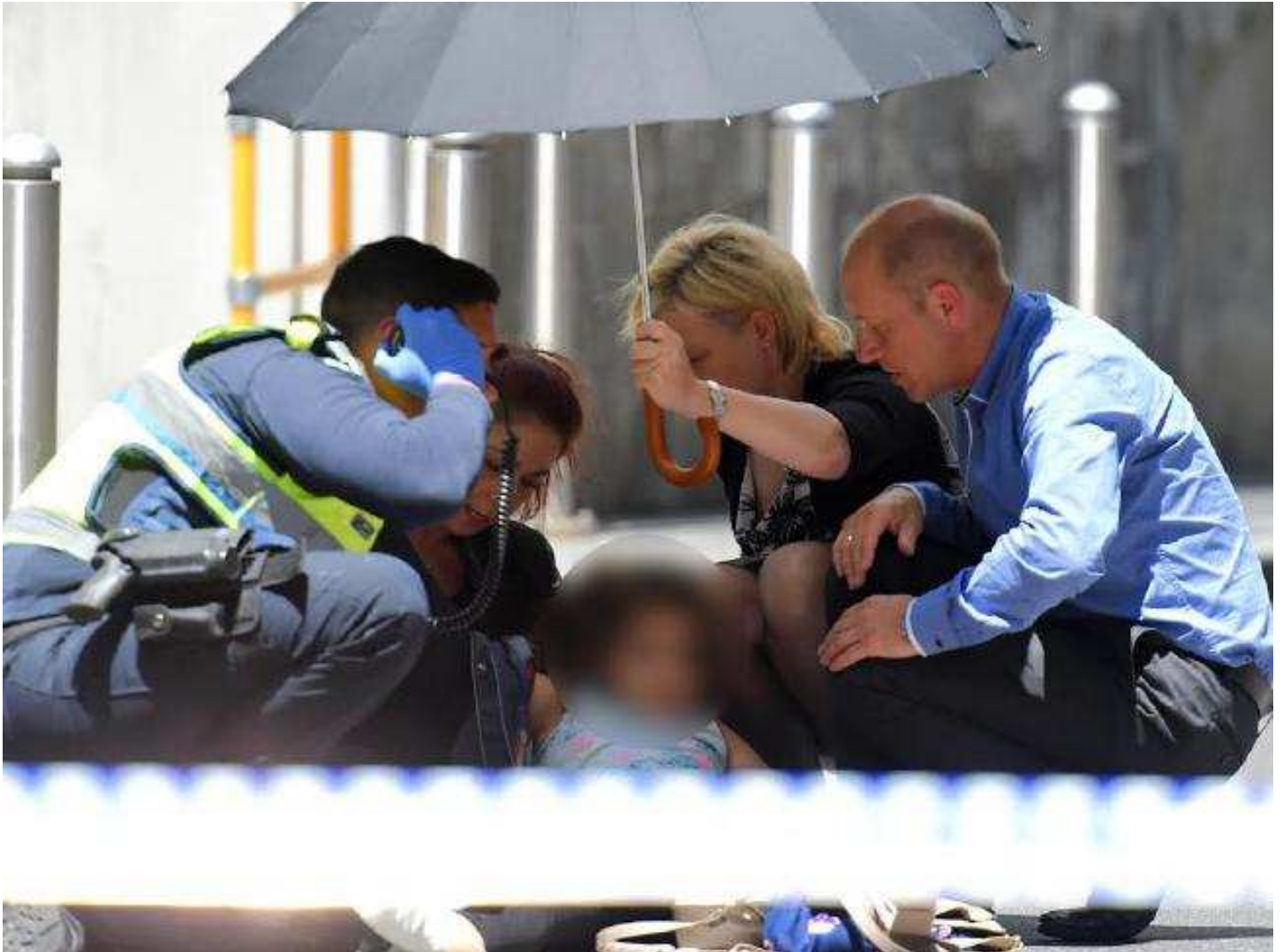
📷 Pedestrians were mowed down in Bourke Street.

Workers, desperate for a safe place, converged on a small Priceline office, not far from where the Commodore was stopped.