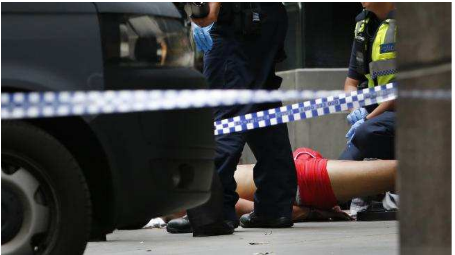
📷 The driver was eventually caught by police.

“It was the Priceline on Little Collins ... everyone staff, members of the public other staff members from other shops everyone was just trying to take cover ... It was like sardines all squished in the Priceline office and then the emergency call over was saying we’re in lockdown make sure you lock the doors and we’re in lockdown.”