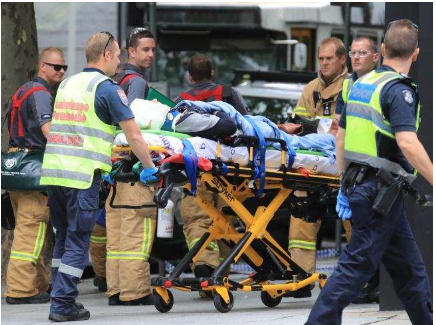
📷 Paramedics at Bourke Street and Elizabeth Street.

A nine-year-old was admitted to a ward in a serious condition with limb injuries, while a 13-year-old was also in a stable condition in the emergency department. “It is a critical incident for those children involved. The staff are doing what they do, they are professionals and they are getting on with it,” he said.