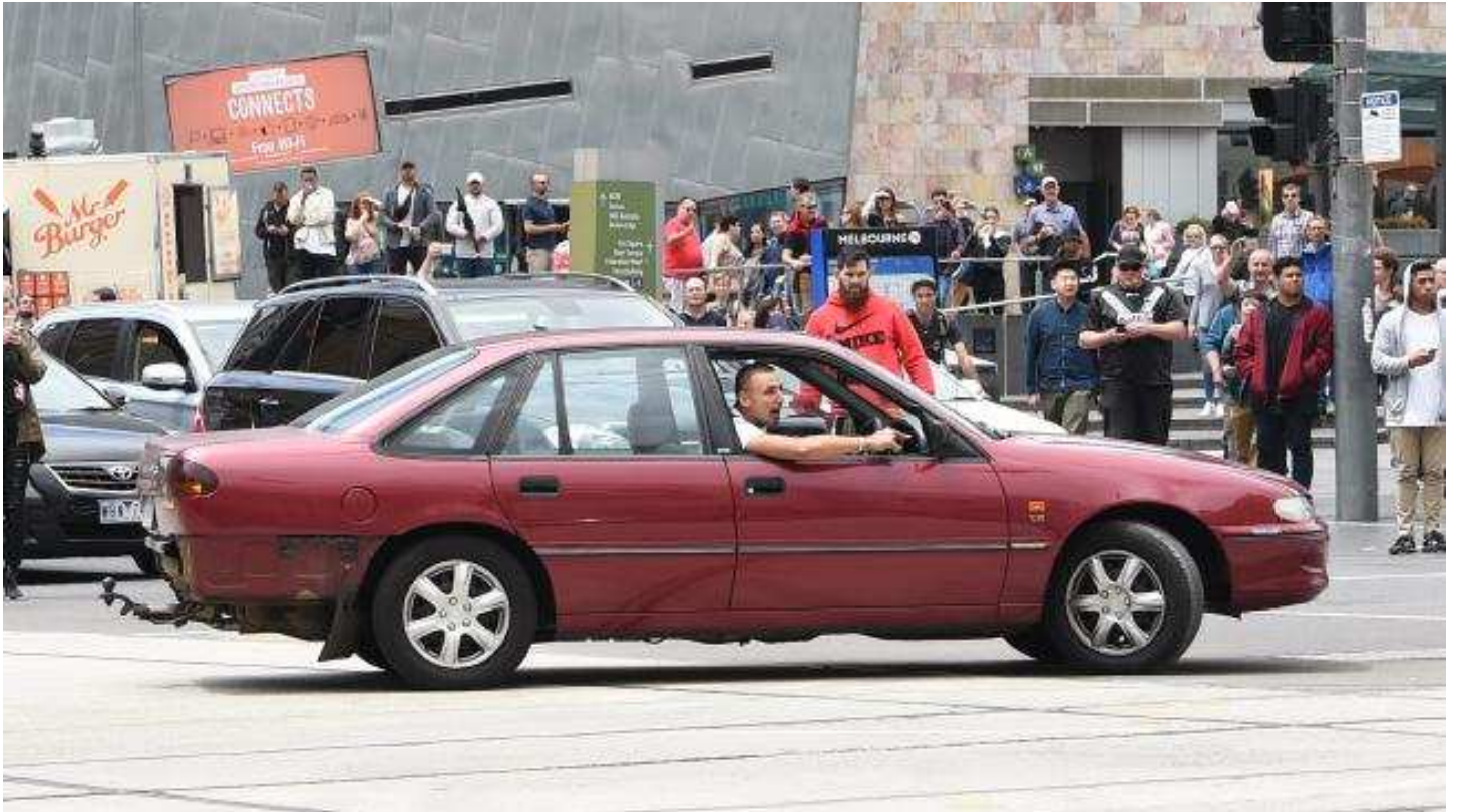
📷 A man doing doughnuts at the intersection of Flinders St and Swanston St.

He also paid “special tribute” to ordinary Victorians who came to the aid of their fellow citizens.