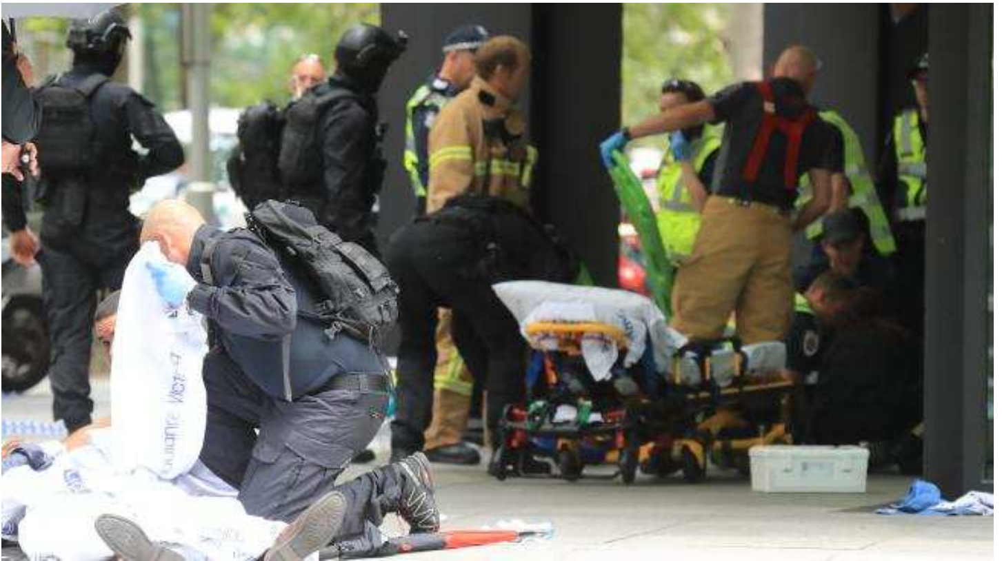
📷 Paramedics and onlookers help the injured.