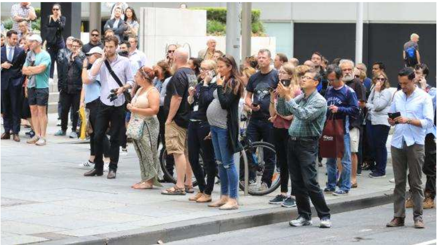
📷 Crowds gathered after the chaos.