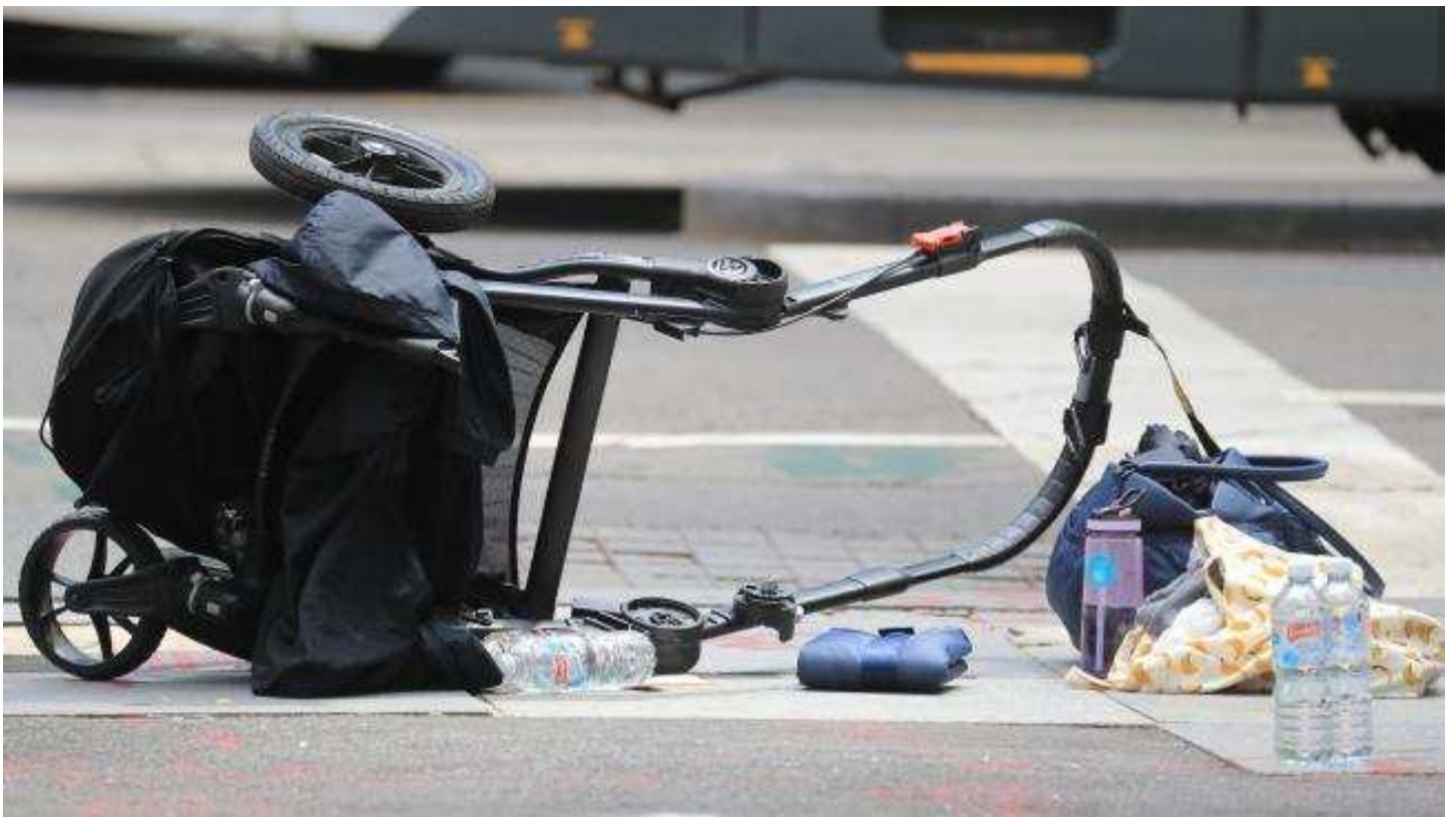
📷 A pram up-ended on the road.

A witness at the RACV Club said they had seen an up-ended pram at the scene.