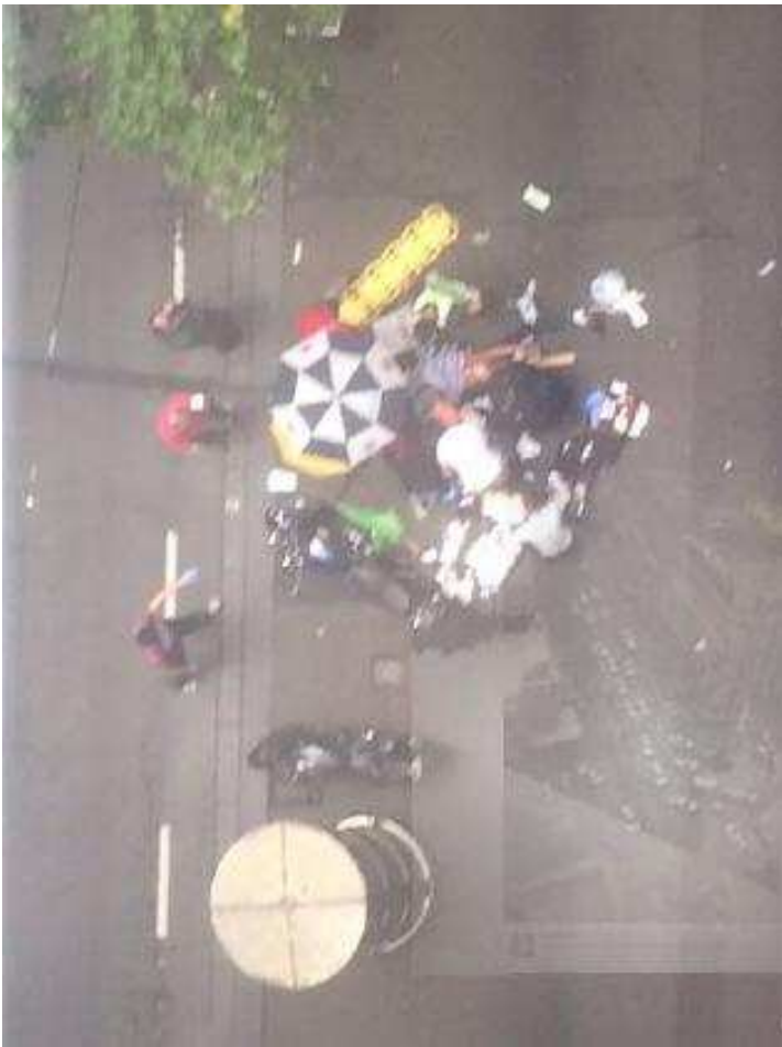
📷 Onlookers tending to a victim who was hit by the speeding car.