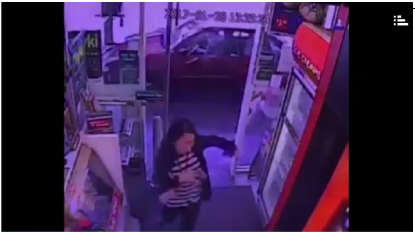
A car speeds on the footpath in CBD