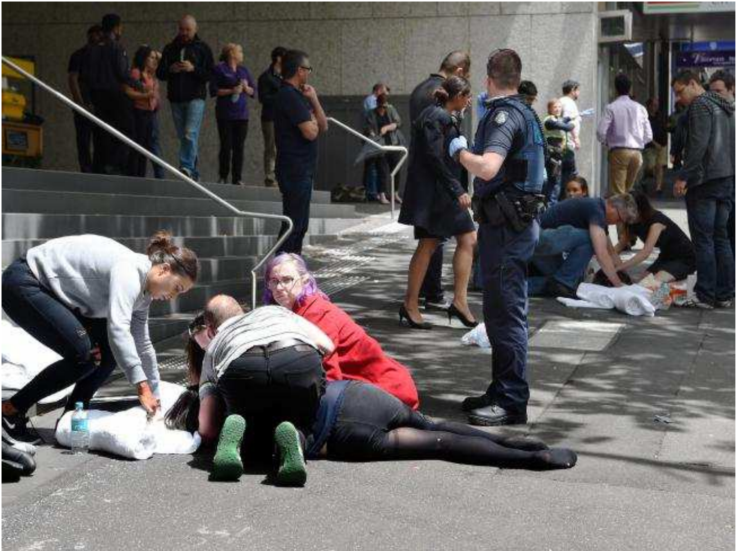
📷 Shoppers rush to the aid of those hit by the car.

The area was filled with workers grabbing food or fresh air during their lunch break.