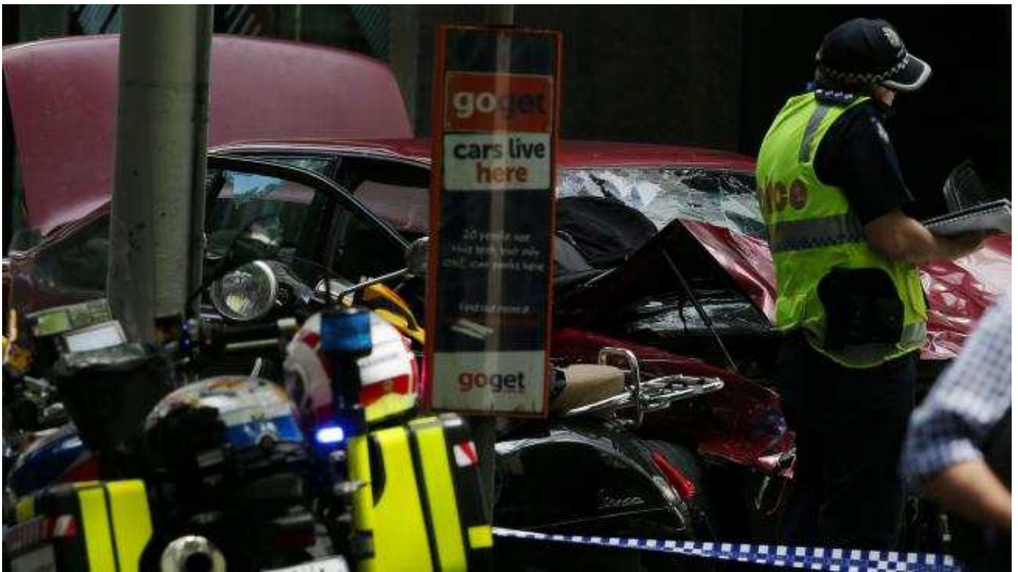
📷 The man later crashed his car and was arrested by police.