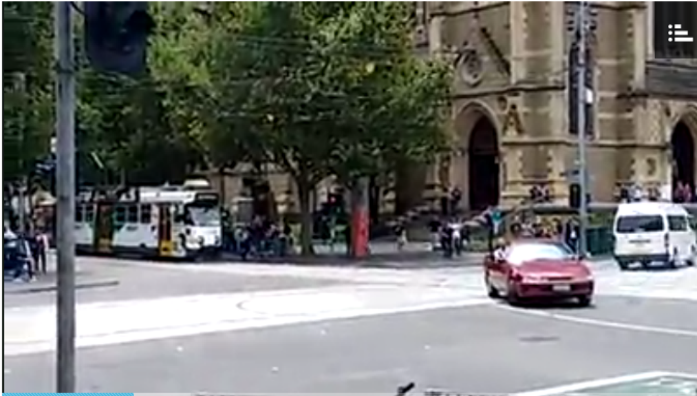
Car drives in circles in CBD